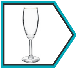
LIBBEY CHAMPAGNE FLUTES 6 OZ. 6 COUNT

PRICES EFFECTIVE SUN. 02/05/12 - SAT. 02/18/12 WHILE SUPPLIES LAST. WE RESERVE THE RIGHT TO LIMIT QUANTITIES. MAINESOURCE ACCEPTS EBT AND MAJOR CREDIT CARDS. WE ARE NOT RESPONSIBLE FOR TYPOGRAPHICAL ERRORS IN AD COPY.