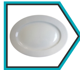
ONEIDA 11.5" PLATTER