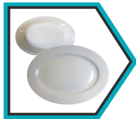
ONEIDA 6.5 OZ OVAL CASSEROLE OR 8 1/8" PLATTER