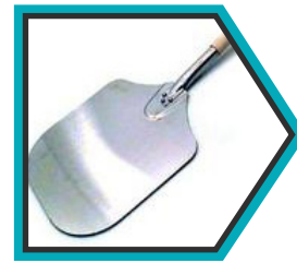
AMERICAN METAL PIZZA PEEL 14" X 16" ALUMINUM WOODEN HANDLE