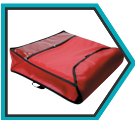
JOHNSON ROSE PIZZA DELIVERY BAG