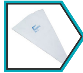
ATECO PASTRY BAG 24 INCH BAG