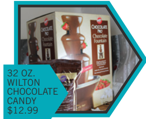
32 OZ. WILTON CHOCOLATE CANDY $12.99