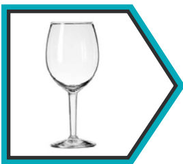
LIBBEY WINE GLASS 8 OZ. CITATION