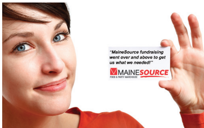
Chef Pierre Pie Fundraiser

Starting with our free consultation to find the best fundraiser, the right pricing, and create your custom order form. Don't forget all of MaineSource fundraising is fully customizable to fit your organization needs. To start any of our fundraisers contact us at fundraisinginfo@maines.net or for more information go to our website www.mainesource.net . All of our store locations are prepared to assist you with the right fundraiser.